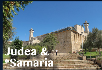
Judea & Samaria