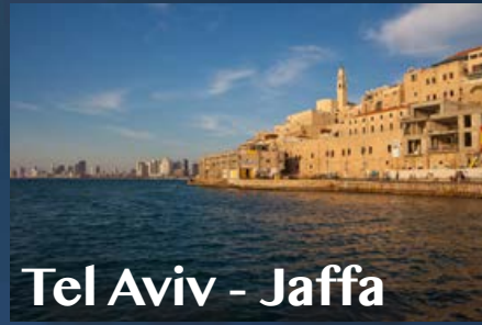
Tel Aviv - Jaffa